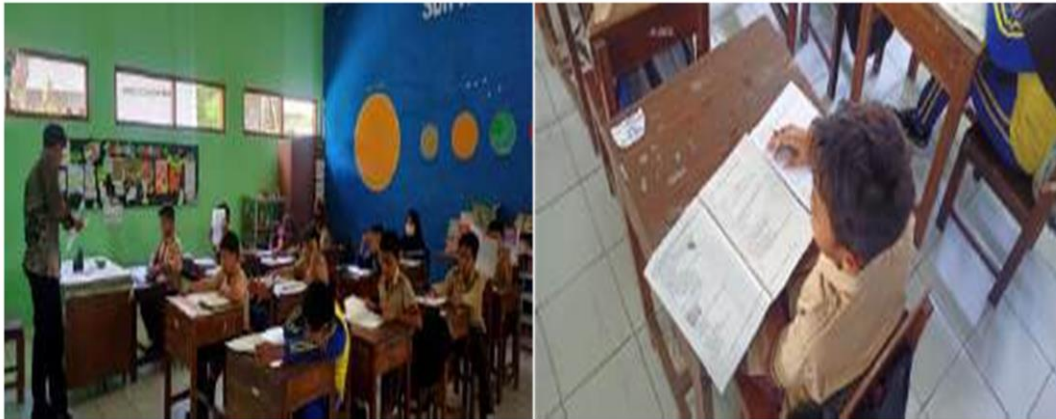
Figure 4. The Class Atmosphere when Students Check the Results of Their Friends' Exam Answers in the Middle Semester Test

R1 said that examining exam questions of this kind provided an educational value that prioritized the students' honesty. Besides this, it could make the work of teachers more manageable. It also provided a stimulus for character education for students so that they acted honestly and fairly at the time.