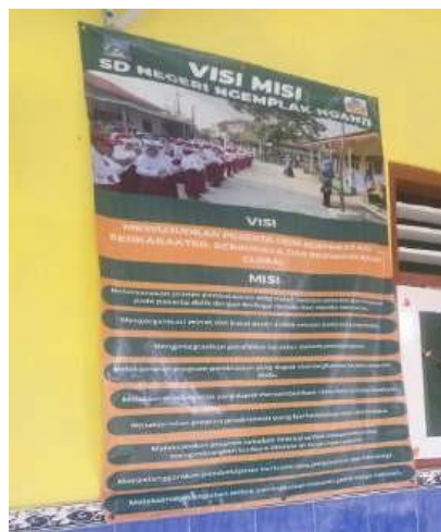
Figure 3. School Vision and Mission

The researchers obtained data regarding a brief profile of SDN Sleman Yogyakarta from the informant, Mr R1. Data regarding this school's brief profile was sent via WhatsApp when researchers asked about the school profile of SDN Sleman, Yogyakarta. Furthermore, researchers found the Vision and Mission of SDN Sleman, Yogyakarta, written on one of the posters posted in the school environment. The vision of SDN Sleman, Yogyakarta is "Creating outstanding students with character, culture and a global outlook". Meanwhile, the school's mission contains at least 9 mission points, as shown in the picture below: