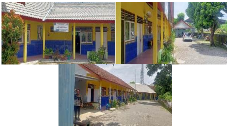
Figure 1. School Environment

In the 2022/2023 academic year, Sleman Yogyakarta State Elementary School has 81 students divided into six grades. Grade I has 9 students, grade II has 14 students, grade III has 12 students, grade VI has 14 students, grade V has 16 students, and grade VI has 16 students. The condition of the school building is adequate to support the teaching and learning process. Each grade has one homeroom teacher. The number of educators and education personnel at SD Negeri Sleman, Yogyakarta, is quite adequate, with 11 people. They consist of 1 principal, 8 educators, 6 homeroom teachers, 1 Islamic teacher, and 1 physical education teacher. The education staff also consists of 1 administrative staff and one janitor.