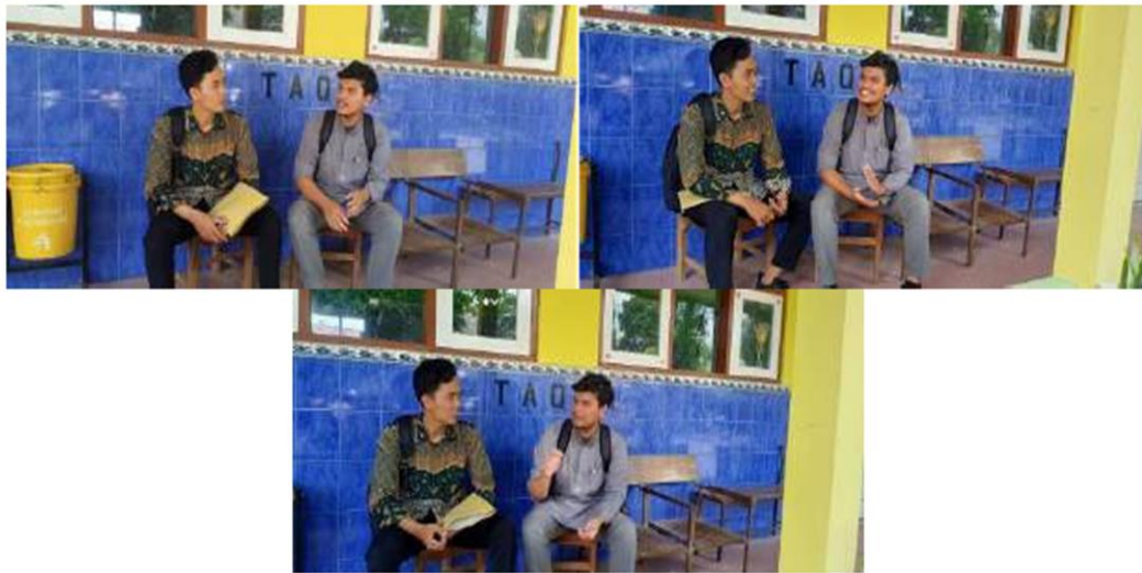
Figure 5. Islamic Education Teacher Interview Process at SDN Sleman, Yogyakarta